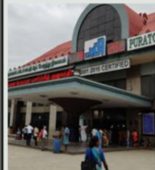
CMBT BUS STAND