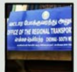
RTO CHENNAI SOUTH WEST