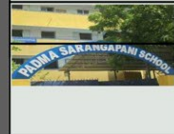
VENKATESA NAGAR 3 rd MAIN ROAD EXT -2